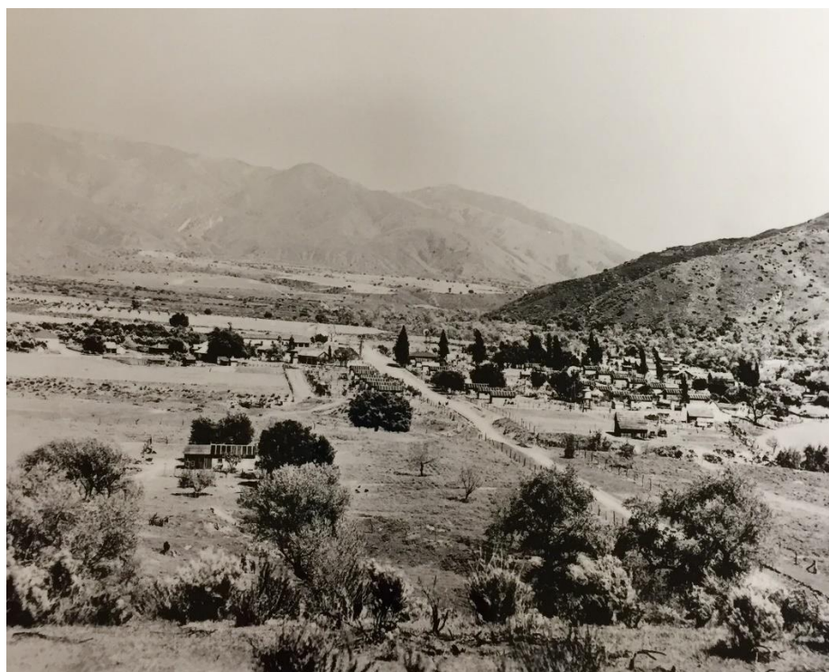
Aerial View of Pala, early 20 th Century